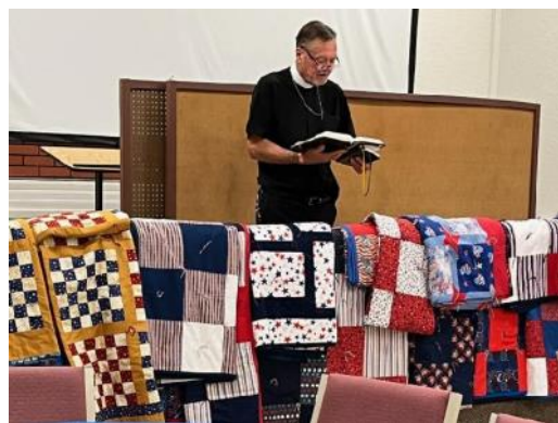
Blessing of the Quilts

Send a paragraph and pictures evangel.flga@gmail.com to be included in an upcoming issue! Please identify everyone