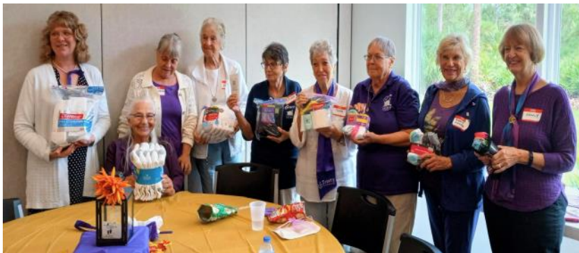
Gifts from the Heart, over 600 pairs of socks collected for Our Brother's Keeper for the Homeless!