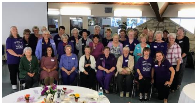
Fall Rally at Grace Lutheran, November 5, 2022