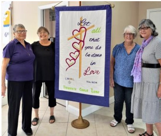
New Treasure Coast Zone Banner

We are looking forward to the Milwaukee Convention, and pray for safe travels for all. To God be the Glory!